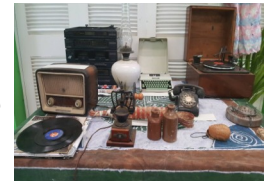
Cultural Fair display

A Cultural Fair organized by the CFB College's History Club, was held on Friday 24 th , the same day that the Nevis Historical and Conservation Society promoted its Heritage Wear Day.